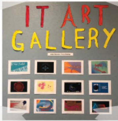
Figure 11a. "IT. ART GALLERY" posted in the Media Minds classroom, with sample illustrations made using Adobe Illustrator.