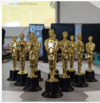
Figure 11b. "Academy Awards" a playful touch to match the theme of filmmaking.

Considering these three definitions of "learning environment" allows a dynamic and relational view to be achieved about how people, space, and objects interact in the process of informal learning. In all three definitions offered, the material and social surroundings matter in their experience of learning (Hopwood and Paulson 2012; Bresler 2013). Theorizing from the intersection of design and education, Bennett (2005, 2006, 2011) has identified properties of successful learning spaces: that they support a distinction between socializing and studying; provide choices and flexible uses for students; allow for territorial claims (i.e. a chair and a desk per student); need some seclusion and control distraction; require a range of activities to reflect engagement; and foster a sense of community. The learning environment of the Media Minds program is effective in that it contains the features of successful informal learning spaces.