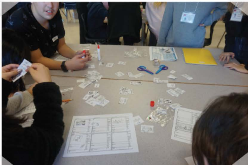
Figure 2 Cutting, pasting, idea-generating.

The Screenwriter's Activity also served as an idea-generating process in which students were able to start thinking about narratives and stories about "transition and change." One of the core objectives of the program was to help students learn to navigate the different, inevitable changes in their transition from elementary school to high school. In order to encourage this, activities in Media Minds were designed around those questions. For example, in a separate workshop activity during Workshop 4, each student was asked to draw their response to some prompting questions about transition and change. A sample worksheet is shown below: