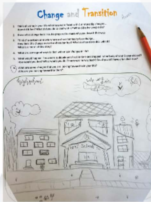
Figure 2. Cutting, pasting, idea-generating.