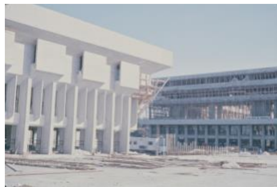
Library, Convocation Mall level