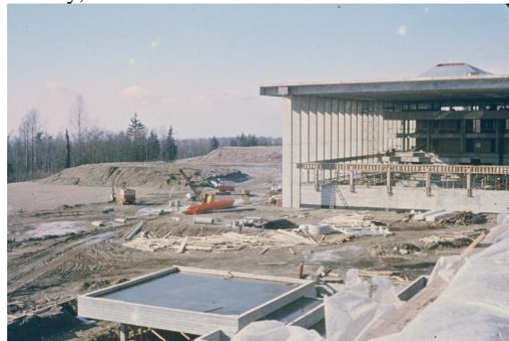
Lorne Davies Complex