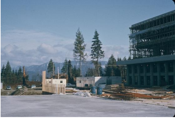
Academic Quadrangle, north side