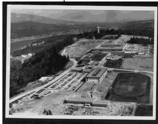
Aerial view of campus looking east