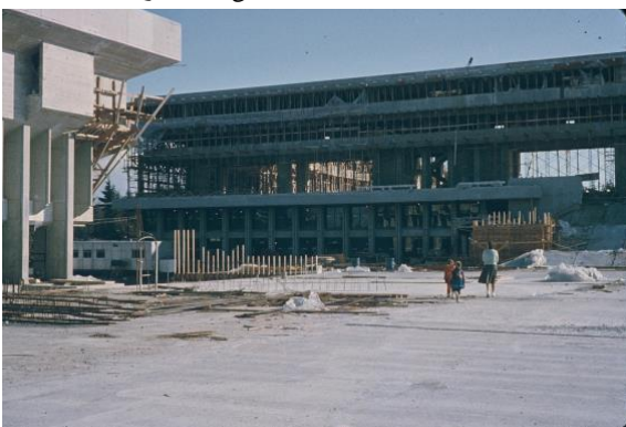
Academic Quadrangle, Convocation Mall level