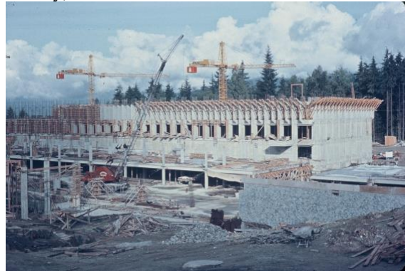
Library, north side