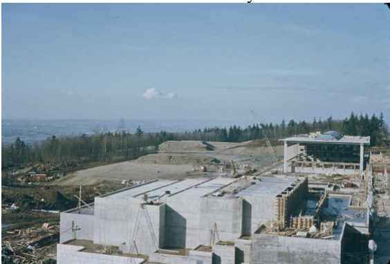
Lorne Davies Complex