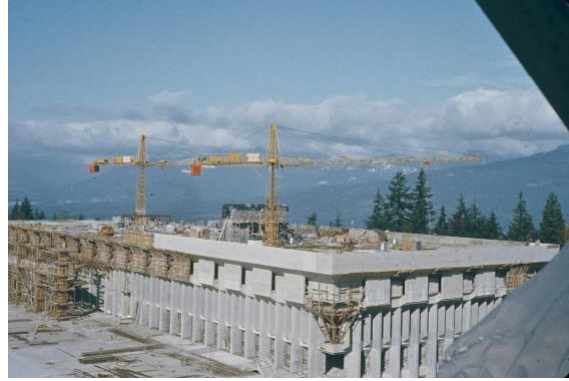
Library, northwest view